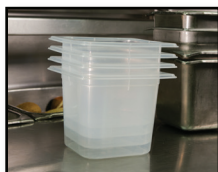
When not in use, nest together for compact storage