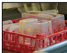
Dishwasher safe, Microwave Safe and BPA Free